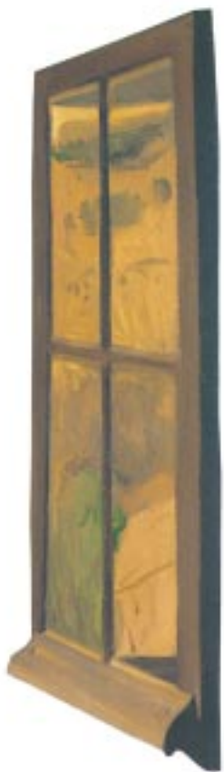
Fig. 1. The open window in Vallotton's Landscape in Provence .

plane that bisects me from the top of my head to between my feet is not a perfect mirror plane (I have, like everyone else, significant left–right asymmetry), that is significantly different from how I look to everyone else. If I wanted to see what I looked like and had a really identical twin, I would look at the twin, not at myself in a reflection. And is it really true to say that, without mirrors, self-portraits would be inconceivable? Surely, true self-portraits are not possible in a single mirror – only laterally inverted ones. I don't think the majority of painters were left handed . . . .